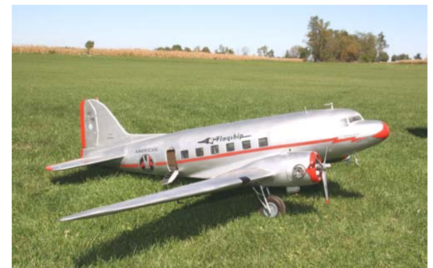
The background of our beautiful flying field is a perfect backdrop for club member Meril "Butch" Hedrick's classic model.