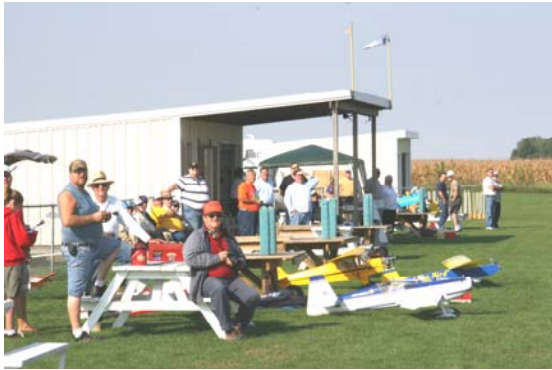
A Fine Facility for enjoying Model Aviation