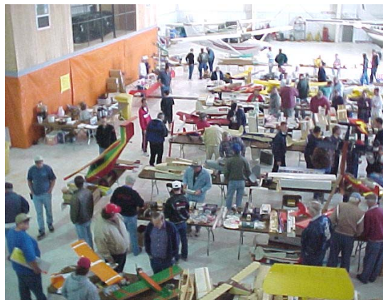
Annual Swap Meet

AMA Chartered Club 291 With over 41 Years of Safe Flying